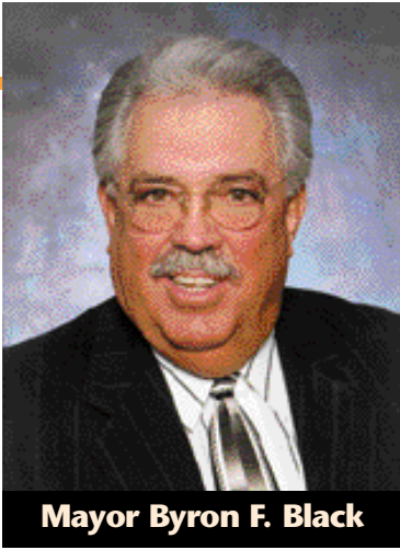
Mayor Byron F. Black