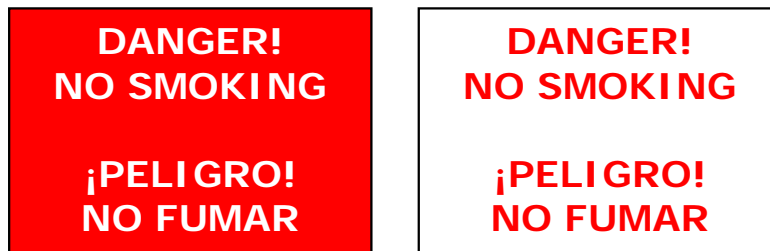
Figure 4: Danger No Smoking Signs