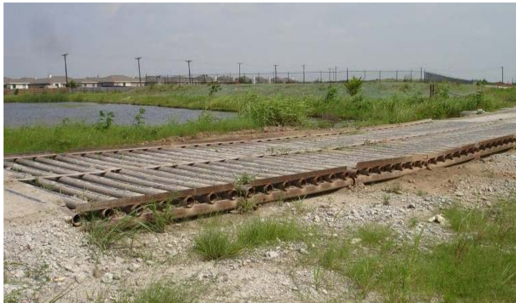
Figure 2: Shaker System