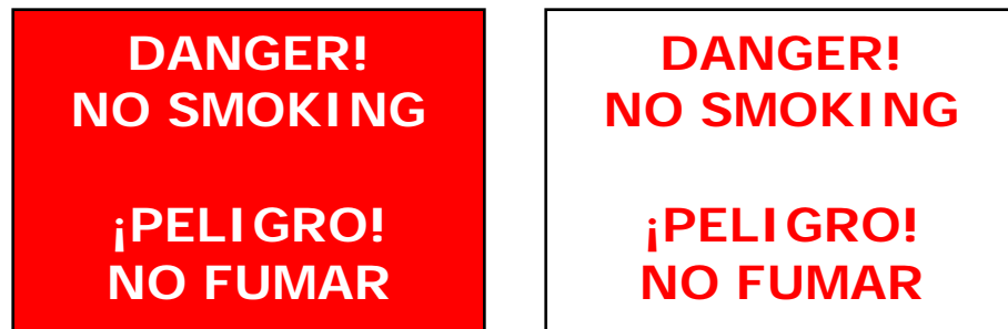
Figure 4: Danger No Smoking Signs